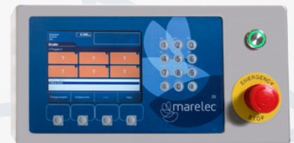
MARELEC Z2 Indicator

Gentle grading: the product is sliding off the belt instead of being launched.